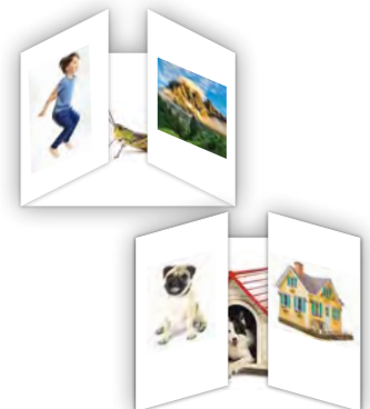
Compound Word Cards