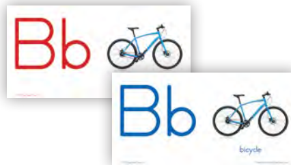
Letter Wall Cards